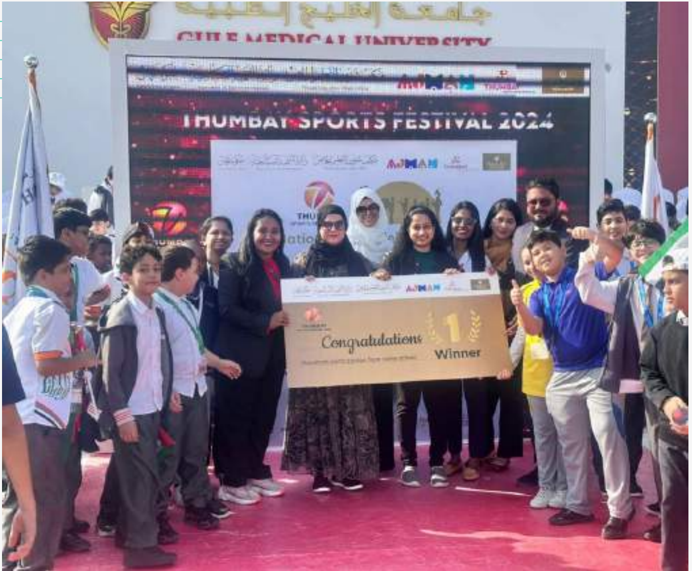
City Private School received First prize in the category Maximum Participation in the Thumbar Sports Festival November 2024