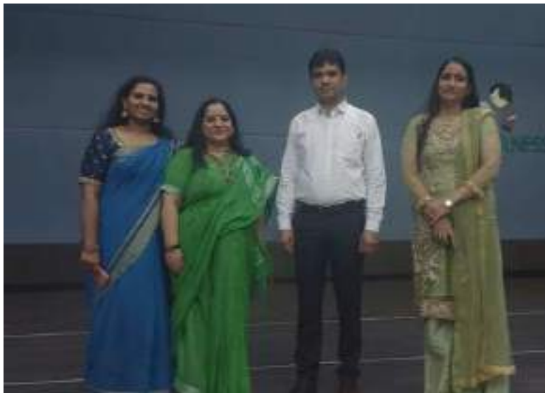
City Private School commemorated this day with a series of engaging activities that aimed to promote the language, culture, and literature associated with Hindi.