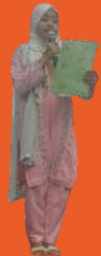
Students recited renowned Hindi poems, showcasing their eloquence and artistic expression.